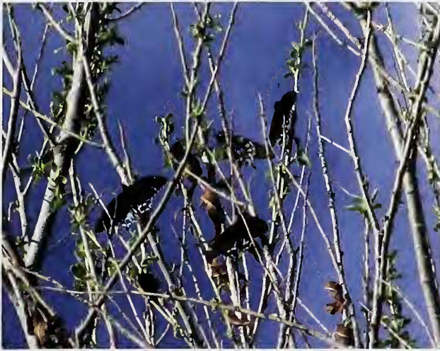
Figure 3. An aggregation of six B. philenor high in a tree in the morning just before the animals disbanded. Note that three of the animals are dorsal basking.